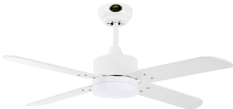
REF. B 2554 WH | Blanco Branco Blanco/Haya Branco/Faia