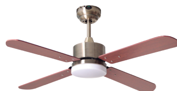
REF. B 2556 AB | Cuero (AB) Oxidado (AB) Cerezo/Nogal Cereja/Nogueira