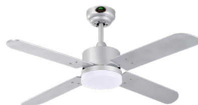
REF. B 2555 SV | Plata Prata Plata/Haya Prata/Faia