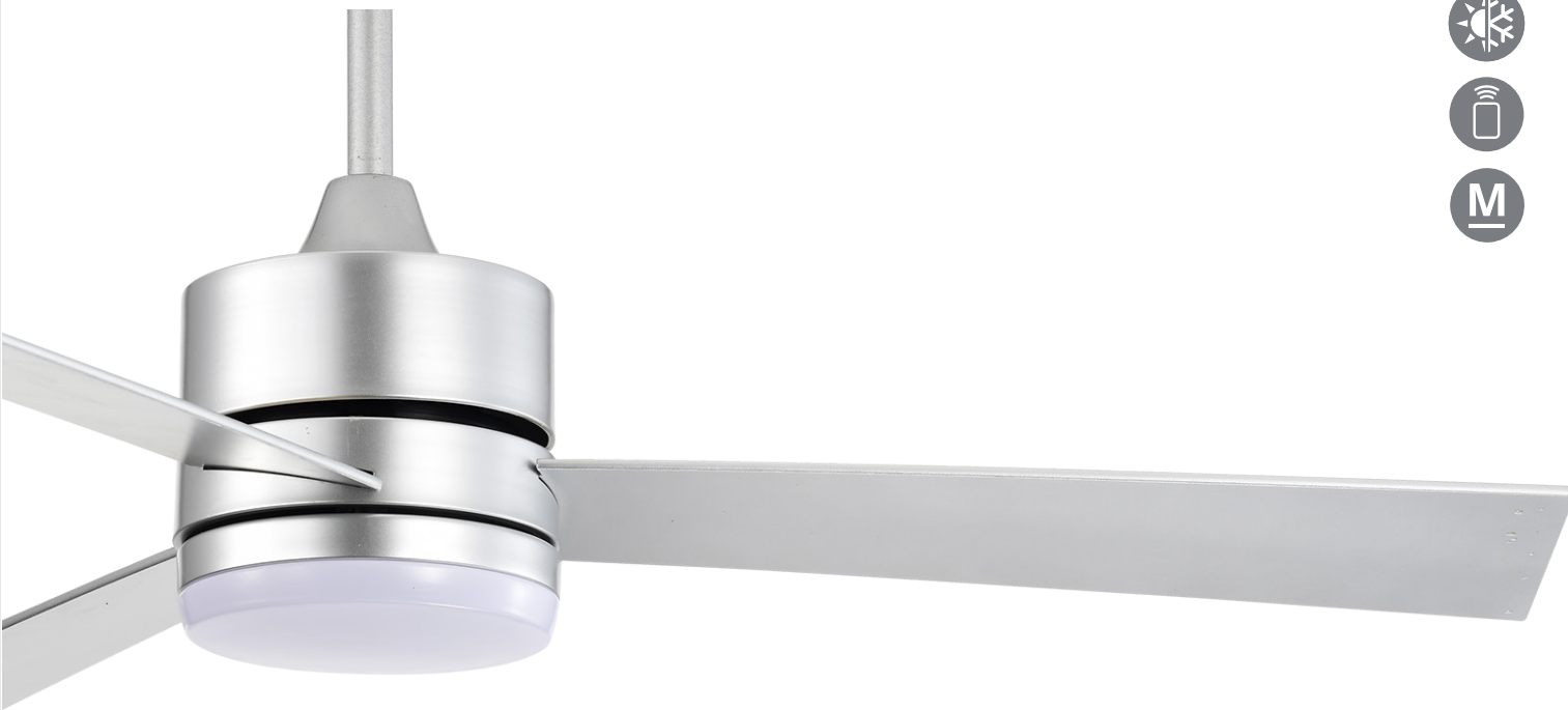
REF. B 2552 SV | Plata Prata Plata/Haya Prata/Faia