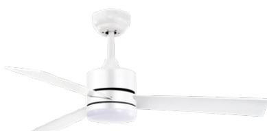
REF. B 2551 WH | Blanco Branco Blanco/Haya Branco/Faia