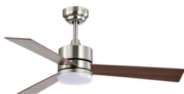
REF. B 2553 SN | Níquel Níquel Cerezo/Nogal Cerejeira/Nogueira