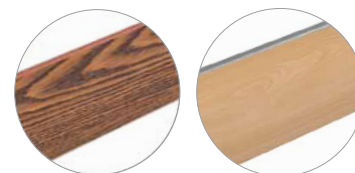
Aspas reversibles Palas reversíveis