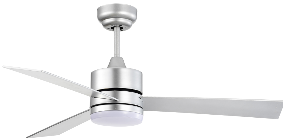
REF. B 2552 SV | Plata Prata Plata/Haya Prata /Faia