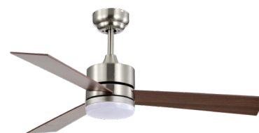
REF. B 2553 SN | Níquel Níquel Cerezo/Nogal Cereja /Nogueira