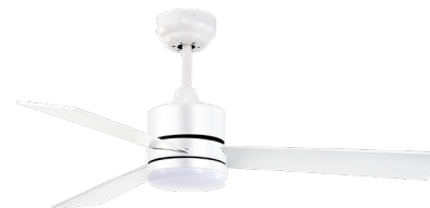
REF. B 2551 WH | Blanco Branco Blanco/Haya Branco /Faia