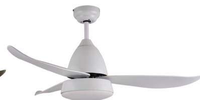
REF. 200594801B | Blanco Branco