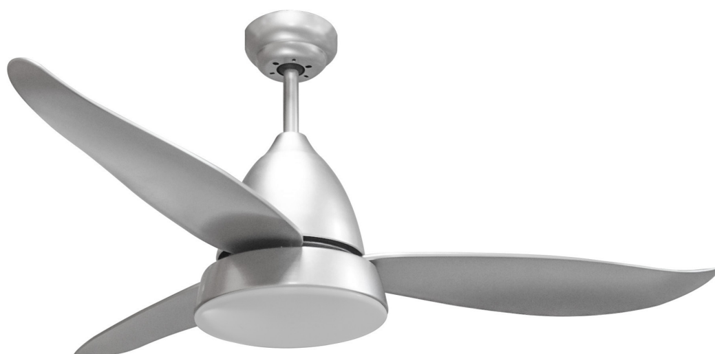
REF. 200594810B | Plata Prata