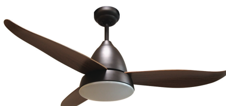
REF. 200594802B | Marrón Castanho