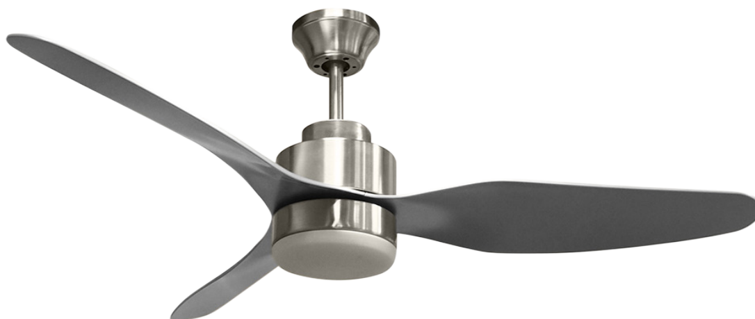
REF. 200394603B | Níquel Níquel