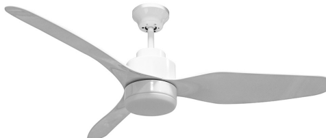
REF. 200394601B | Blanco Branco